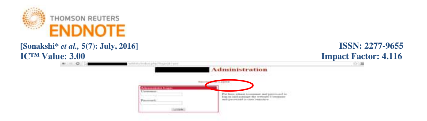
Fig. 21 Attacker successfully logged out of admin account

Another website shown in Fig. 22 which is vulnerable to SQLI attacks is demonstrated below with the help of screenshot, its URL is: www.southbayballet.org/photo-gallery.php?id=38. Now, the foremost task is to find out whether the given site is vulnerable or not. To do this, a single quote (') is appended at the end of URL. If an error message is displayed at the screen, such as "You have an error your SQL syntax; check the manual that corresponds to your MySQL server version for the right syntax to use near "' at line 1" , then the given website is vulnerable. Also here, it shows the additional information about the table name such as southbay_showimages and column names such as image_id, show_id. We can use this information for some illegal means such as tables can be deleted from the database.