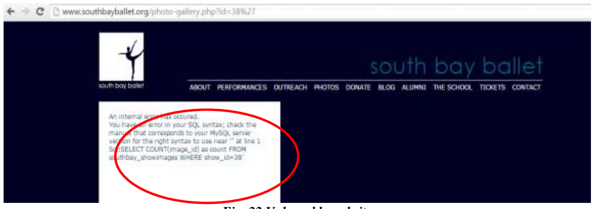
Fig. 22 Vulnerable website

Another website shown in Fig. 22 which is vulnerable to SQLI attacks is demonstrated below with the help of screenshot, its URL is: www.southbayballet.org/photo-gallery.php?id=38. Now, the foremost task is to find out whether the given site is vulnerable or not. To do this, a single quote (') is appended at the end of URL. If an error message is displayed at the screen, such as "You have an error your SQL syntax; check the manual that corresponds to your MySQL server version for the right syntax to use near "' at line 1" , then the given website is vulnerable. Also here, it shows the additional information about the table name such as southbay_showimages and column names such as image_id, show_id. We can use this information for some illegal means such as tables can be deleted from the database.