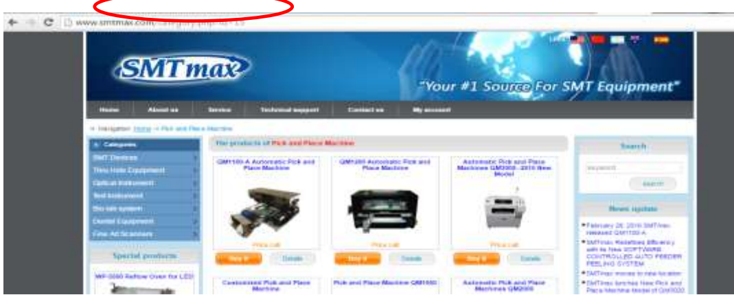
Fig. 23 SQLI Vulnerable website

Upon appending single quote (') at the end of URL, we will be able to identify whether the particular web application is vulnerable to SQLI attack or not. The following screenshots will show the step by step procedure to do attack via URL of a vulnerable website.