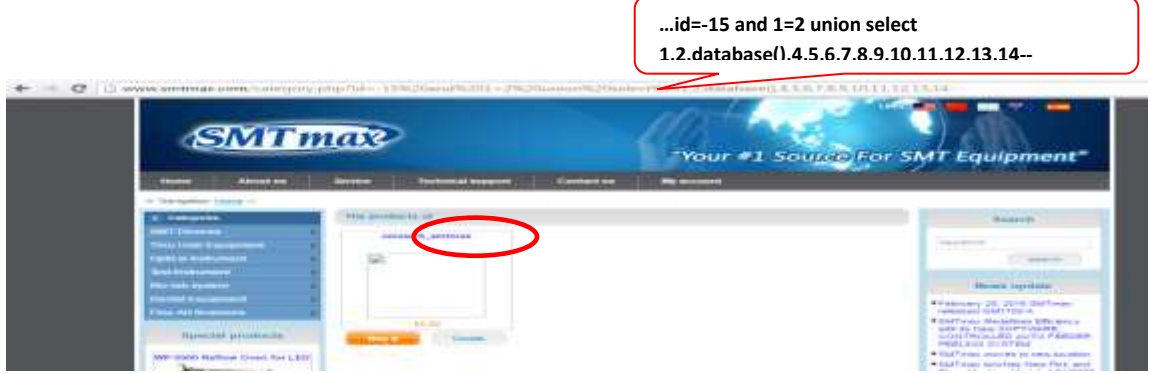
Fig. 28 Database is shown using database() function injection in URL

The following figures will describe the above steps.