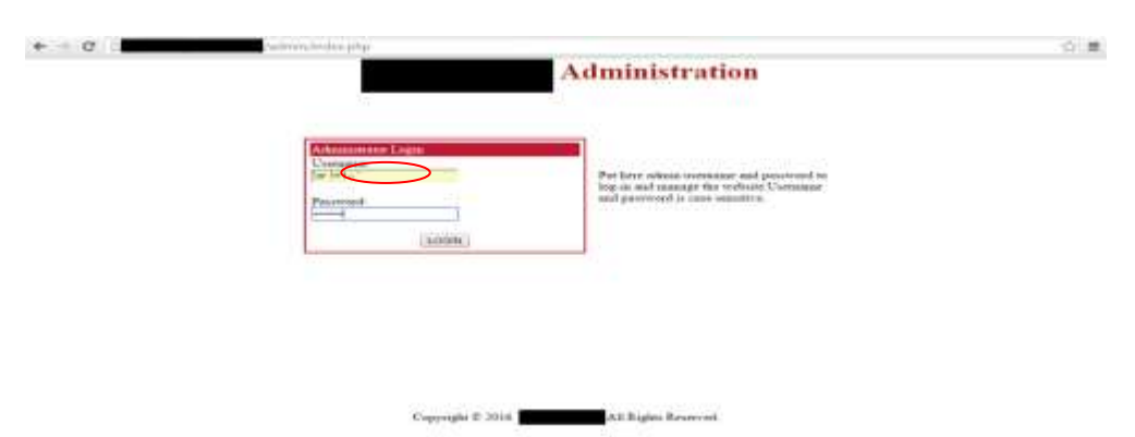
Fig. 17 Tautology attack on vulnerable website

There are some websites which are still vulnerable and hence, the probability of performing attacks on them is very high. Before performing SQLIA on some website or via URL, one must be sure if the site is vulnerable or not. There are some methods to find out, if the site is vulnerable to SQLIA. By making use of those methods, vulnerable sites are found and SQL injection attack is performed using various methods on those sites for the purpose of doing case study. These attacks are shown below.