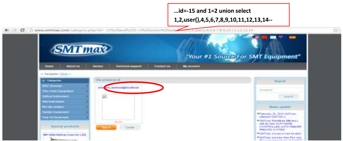
Fig. 29 Client name is displayed by using user() function in URL